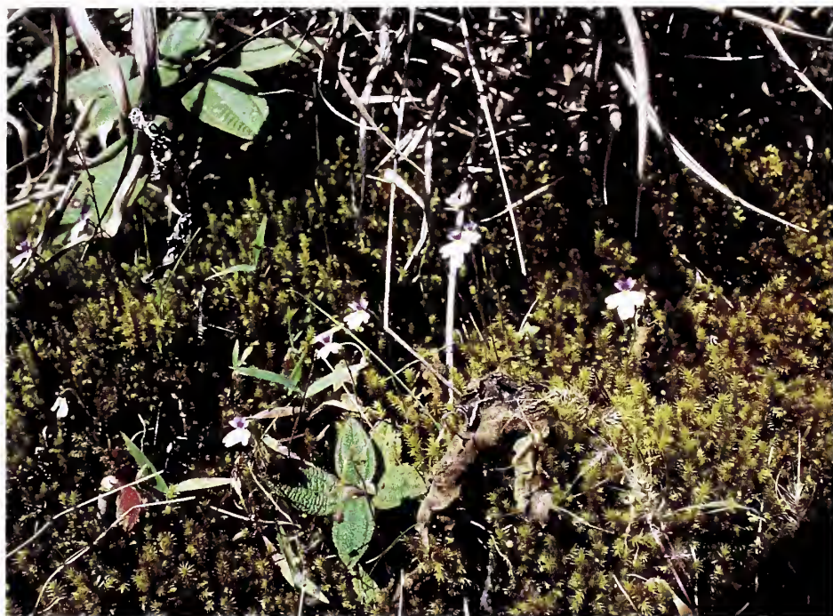
Figure 1: G. lobata at Serra do Caparaó.